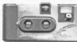
4D Magic one time use