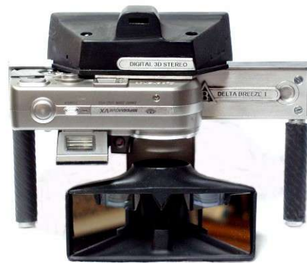
DELTA BREEZE IS SHOWN WITH THE VIEWER SLID OVER THE LCD SCREEN, READY FOR SHOOTING.