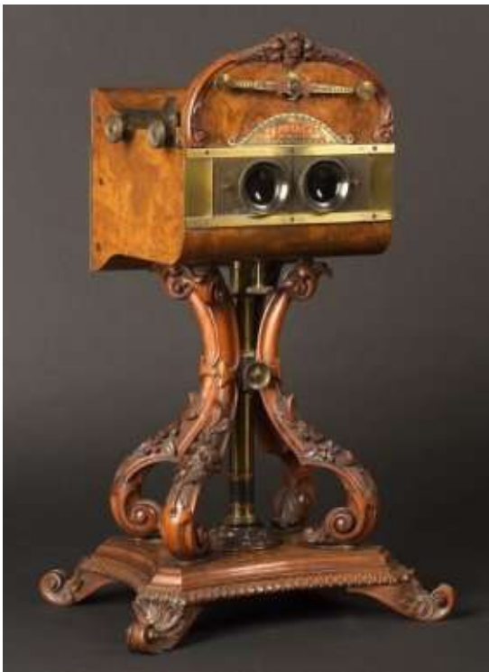
Wonderful early Stereoscope that was recently sold.