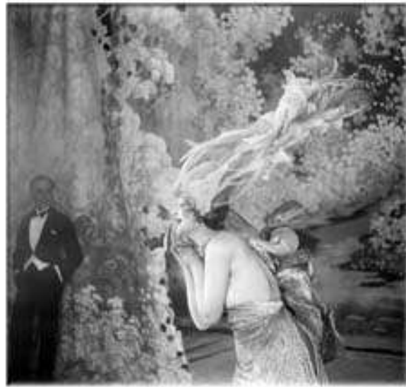
Jacques Lartigue stereo image of an Opera