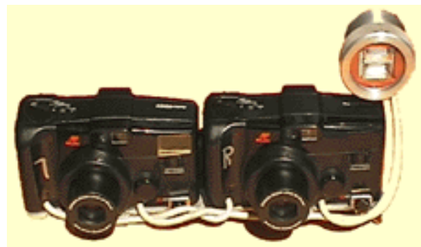
German stereographer camera set-up