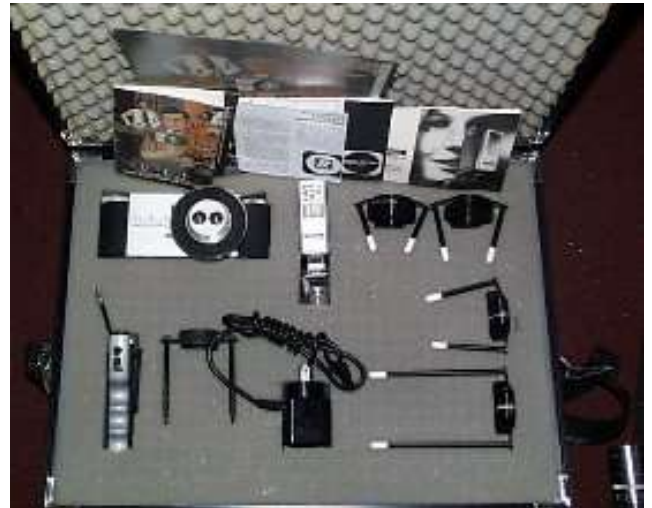
Complete Realist Macro outfit - very rare