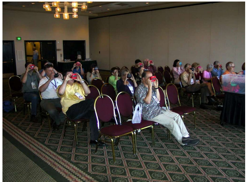
vladmaster ViewMaster workshop