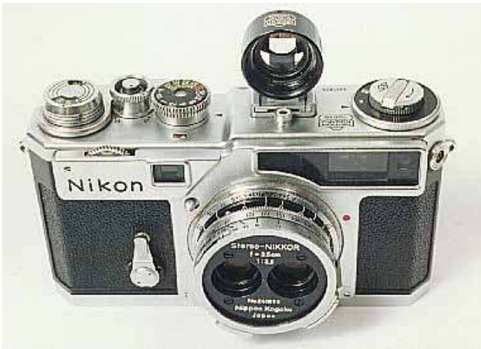
Nikon Rangefinder stereo lens