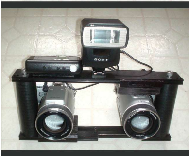
Sony f717 with Rob Crocketts lanc connector and flash set up at different stereo bases, Elliot Swansen's setup