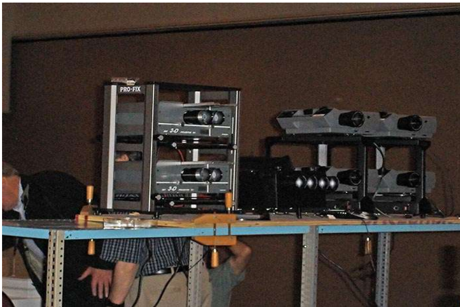
NSA Stereo Projectors RBT's, Brackett, Carousels