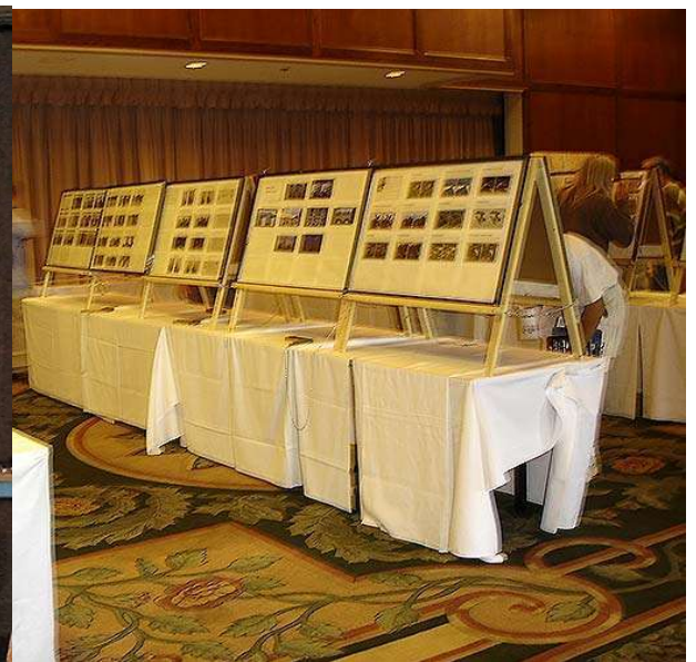
NSA Stereo cards display