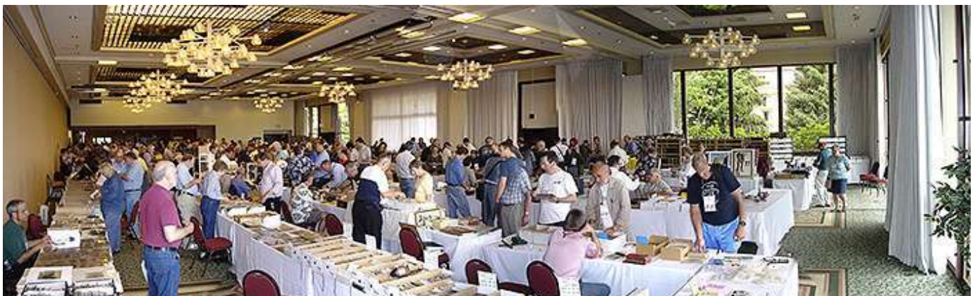
NSA Trade Show