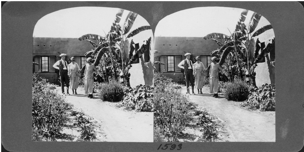
"In the hotel at Rancho Santa Fe California July 9, 1924"

A couple of recent stereo cards acquisitions by your editor.