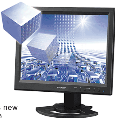
Sharp's new 3D LCD monitor