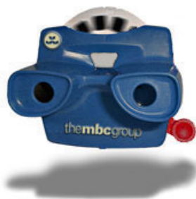
ViewMaster's in current commercials