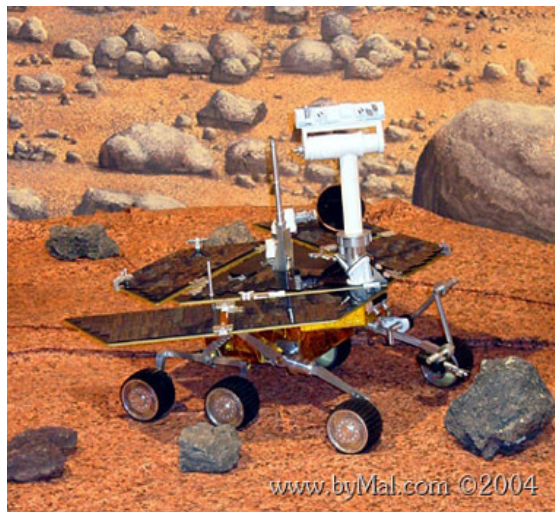
Model at JPL of Mars Rover from a recent LA Stereo Club outing