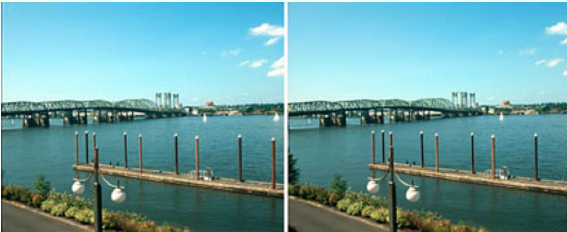
View from Jantzen hotel in Portland, OR., site of this years NSA Convention