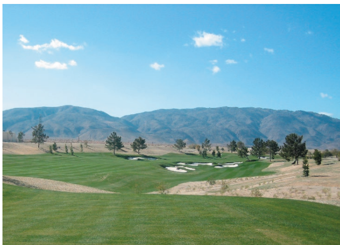
New Fazio #7

Thank you again for all of your support and encouragement. We have some exciting months ahead, bringing you more new holes on the Fazio course and keeping your golf experience on the Robinson nine as pleasant as possible.